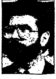
Gerry Adams

But Adams, canvassing for support in West Belfast, the stronghold of Catholic nationalists who want a united Ireland, says a vote for Sinn Fein is a vote for peace. He says his party needs to gain a foothold at the heart of Britain's political system. Sinn Fein says it could capture as many as three seats in the election but will leave